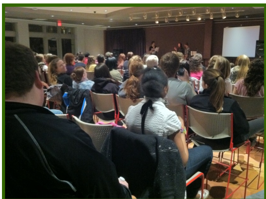
IUP Cru weekly meeting

momentum the spring starts big and eventually dwindles to record lows of consistent involvement. We found just the opposite as each week more and more people were showing up, hungry to grow, even on conflict nights (when popular concerts or other events were happening on campus).