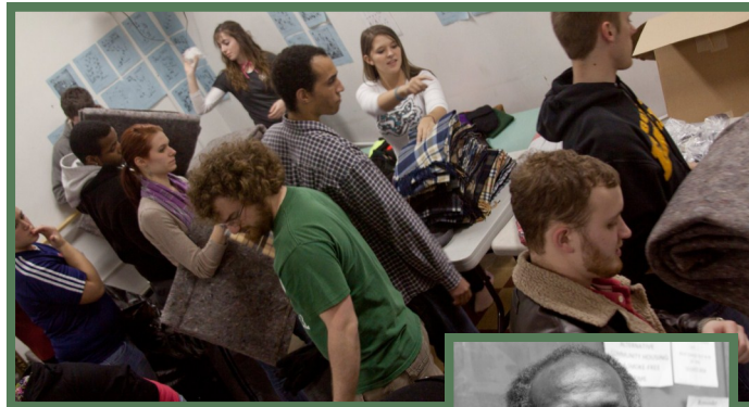
IUP and other college students serving Detroit

You may remember the great blessing it was last year to send our students out to Detroit over their Spring Break. What an amazing time of growth for our students as I watched them wrestle with the brokenness of the city and take steps to share their faith. In fact that may have been the decisive moment when they really caught a vision for reaching their campus for the gospel!