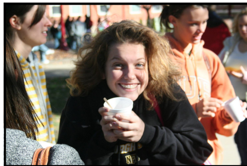
Students were more than willing to stop and talk with us, sometimes even help us!