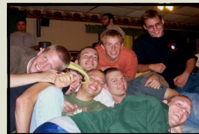
Some IUP Leaders at our Fall Retreat