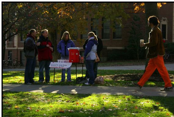
We went through about 200 cups in two hours, selling out everyday by 11:30 AM

After a snow flurry, and freezing temperatures we ended with a sunny day.